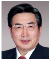
执行会长 郭金龙 EXECUTIVE CHAIRMAN Guo Jinlong

中共中央政治局委员、北京市委书记 Member of the Political Bureau of the Communist Party of China (CPC) Central Committee, Secretary of the Beijing Municipal CPC Committee