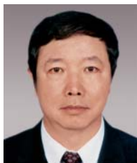
副会长 于再清 VICE CHAIRMAN Yu Zaiqing

北京市副市长 Vice Mayor of the Beijing Municipal People's Government