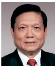
会长 刘淇 CHAIRMAN Liu Qi

中共中央政治局委员、北京市委书记 Member of the Political Bureau of the Communist Party of China (CPC) Central Committee, Secretary of the Beijing Municipal CPC Committee