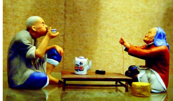
Clay Sculpture ZHANG

like a long pretzel), and “Maobuwen” Dumplings. Other tasty snacks include: Zhangji Nuts, Caoji Donkey Meat, Dafulai Crispy Rice Dish, Shitoumenkan Vegetable Bunds, Zhilanzhai Pastry and Corn Bread with Braised Small Fish. Fried Round Bread, Fried Long Bread, Tasty Tofu, Soymilk, Dumpling Soup and Jianbing are favorite breakfast foods in Tianjin.