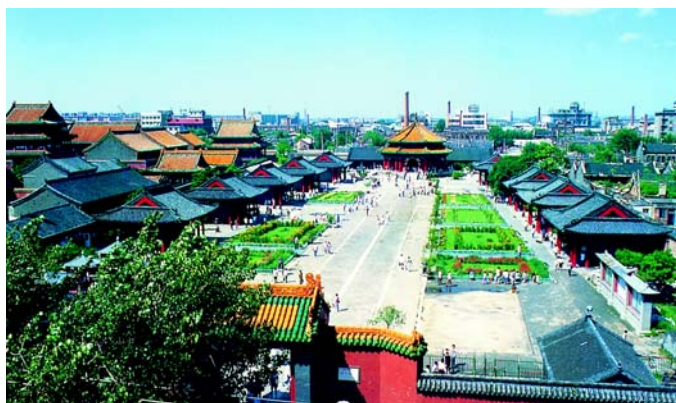
Shenyang Ancient Palace

Shenyang has a population of 6,710,000, including many minorities. Besides Han Chinese, 32 minorities live in this city, including Manchu, Korean, Muslim, Xibo and Mongolian. It has 9 subordinate districts, 1 county-level city and 3 counties.