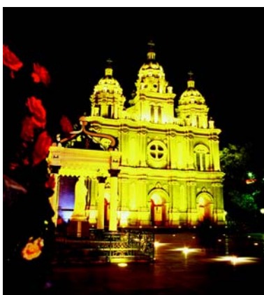
Catholic Church, Wangfujing

Catholic organizations include the Beijing Catholic Patriotic Association and the Beijing Catholic Administration Committee. Famous churches include Xuanwumen